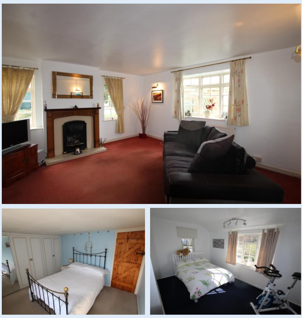
'CHARMING AND BEAUTIFULLY PRESENTED PERIOD COTTAGE'

The cottage is just a few doors from the Mole and Chicken - a wonderful country pub and restaurant with cosy log fires, al fresco dining and five beautiful B&B rooms.